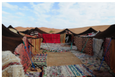
See Morocco, page 7.